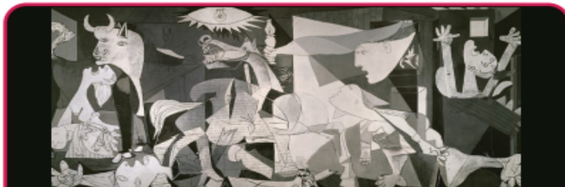
Pablo Picasso A Spanish artist who co-founded the Cubism art movement with artist Georges Braque in 1909.

Cubism ignores perspective and artists paint their subjects from lots of different angles.