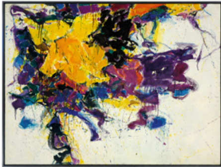
Sam Francis An American painter and printmaker.

Sam Francis, Untitled, 1958