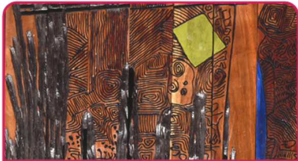
El Anatsui An artist and sculptor from Ghana.