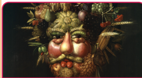
Giuseppe Arcimboldo An Italian painter best known for creating imaginative portrait heads made of objects such as fruits, vegetables and flowers.